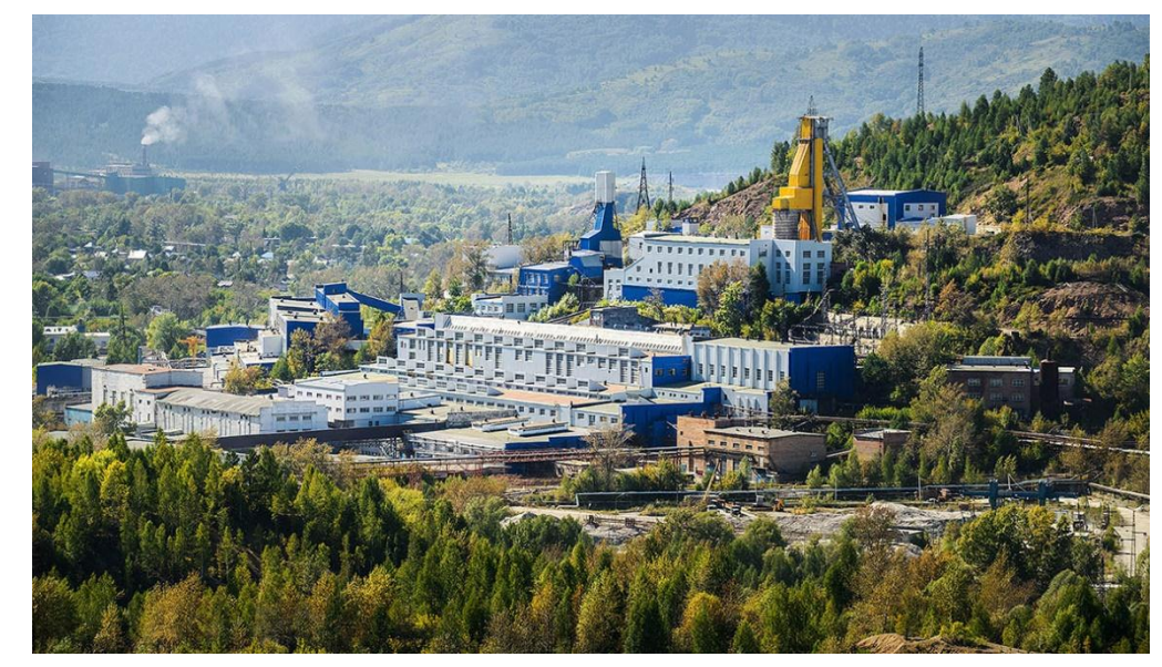
Ridder Ore Mining and Processing Plant, LLC Kazzink

As a result of the operation of processing and metallurgical plants that process polymetallic ores, a large amount of waste is generated.