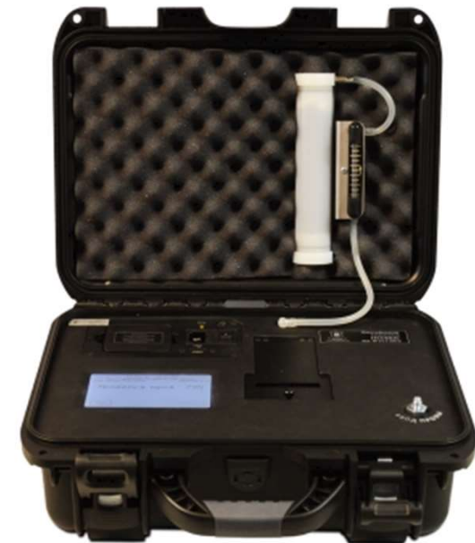
Refrigerant indicator "Polyus"

Both are based on the principle of non-dispersive infrared spectroscopy and have the ability to determine a large number of pure and mixed refrigerants. Including prohibited and / or restricted for use under the Vienna Convention for the Protection of the Ozone Layer and the Montreal Protocol on ODS